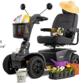
FDA Class II Medical Device 1