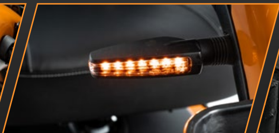
Enhanced LED lighting