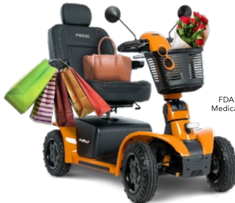
FDA Class II Medical Device 1