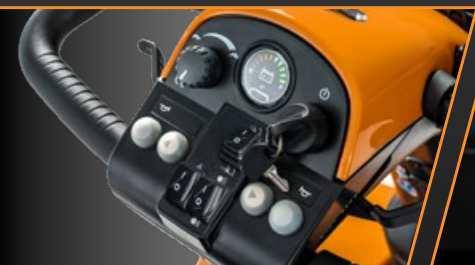
Infinitely adjustable tiller with USB charger