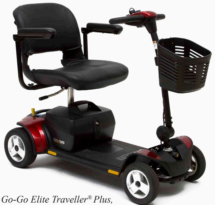
Go-Go Elite Traveller® Plus, 4-Wheel

The Go-Go Elite Traveller® Plus was designed to bring travel scooters to a greater range of people than ever before. An increase in length and width, and a weight capacity of 300 lbs. (325 lbs. w/HD version) combine with wraparound delta tiller to allow both the larger individual and those with limited dexterity to experience the benefits of a travel-specific mobility product for the first time. One hand feather-touch disassembly makes the Go-Go Elite Traveller Plus the easiest travel scooter to take along anywhere.