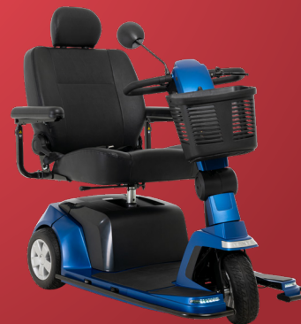
3W — FDA Class II Medical Device 1