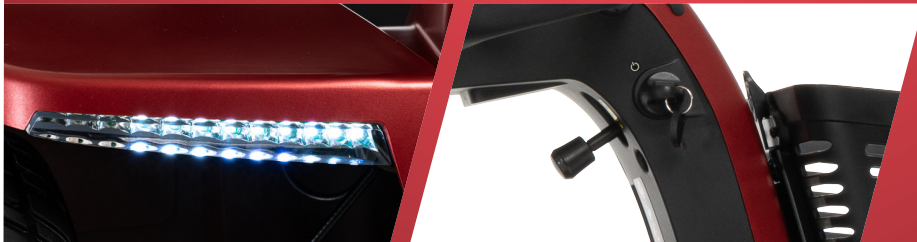
Full LED light package